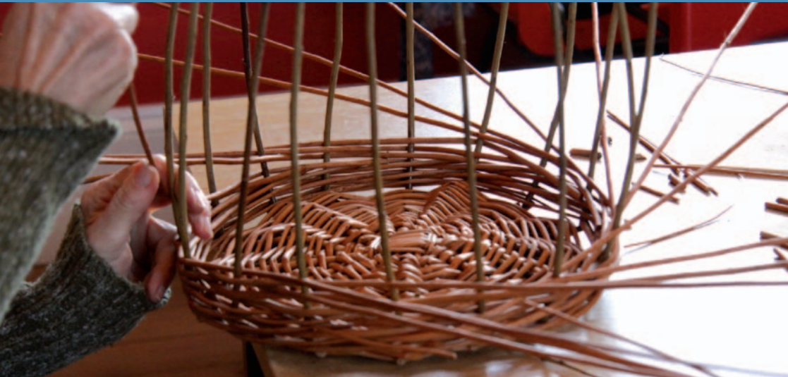
Having staked-up you start a weave call the three-rod wale (above), with three rods inserted behind three consecutive stakes. You can insert another three rod wale higher up (left) for strength

Carol and I were on a bit of a tight deadline and as Carol had wanted a fruit basket for her kitchen we had reached sufficient height to commence making our rims. This is made from the stakes which you now bend down to the right and weave into a pattern, of which there are many varieties. The pattern we used is called a 'three behind two rod border' which is quite complex but mostly consists