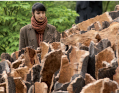
Discover David Nash's latest sculptures at Kew and summer activities in the woods

More great articles! On sale 30th August